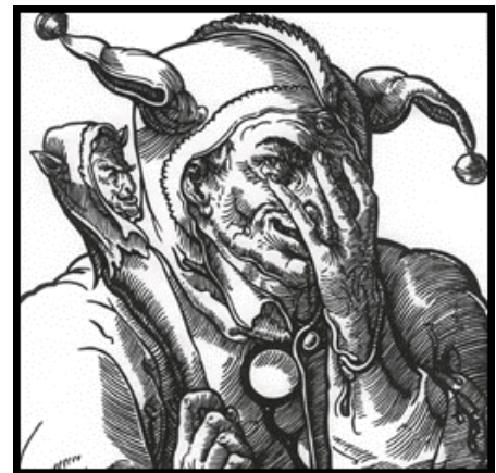
The Fool, by Vogther, the younger

The most widespread theory about the origin of April Fool's Day involves the Gregorian calendar reform of the late sixteenth century.